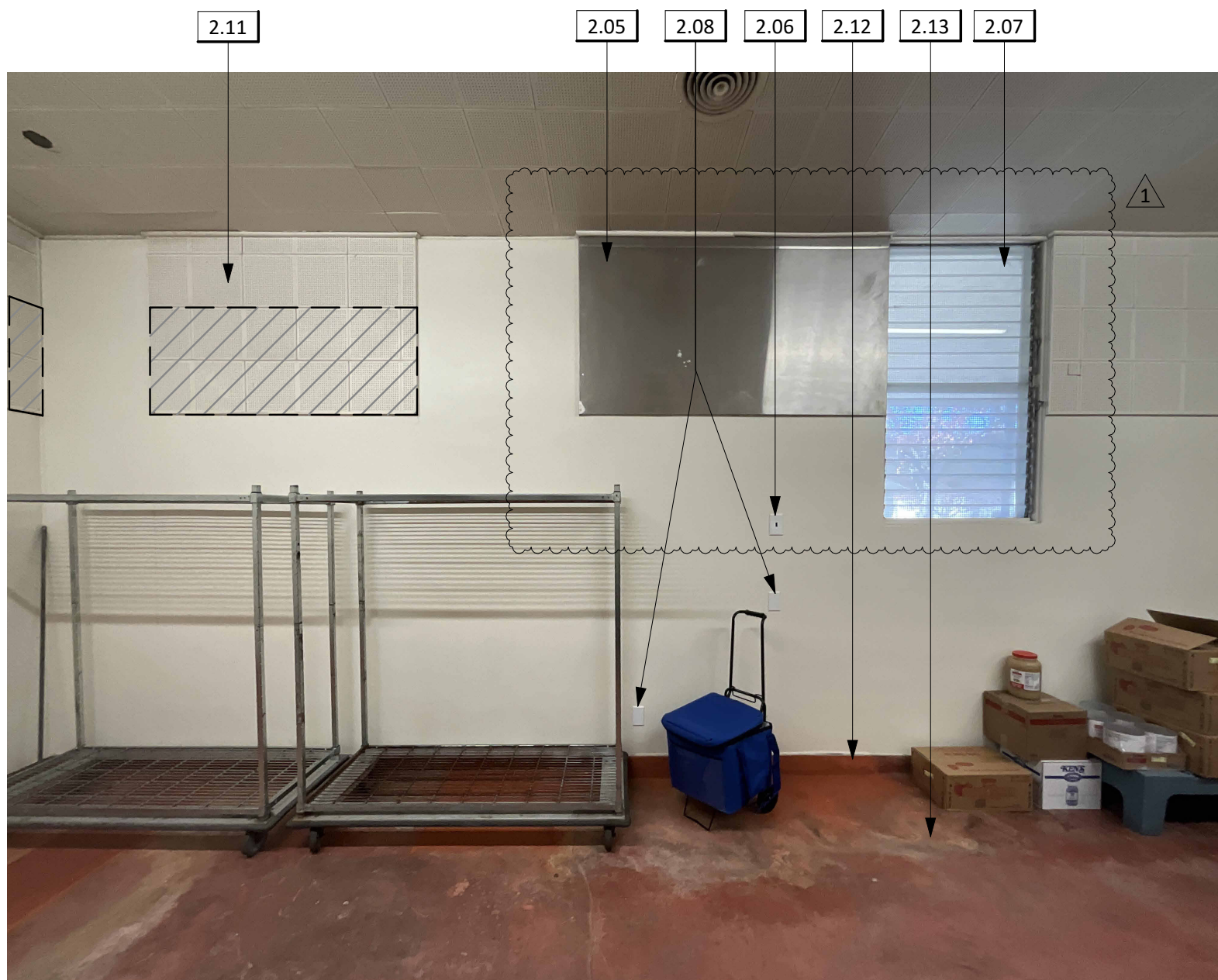
4 INTERIOR DEMOLITION ELEVATION - WEST 1/2" = 1'-0"