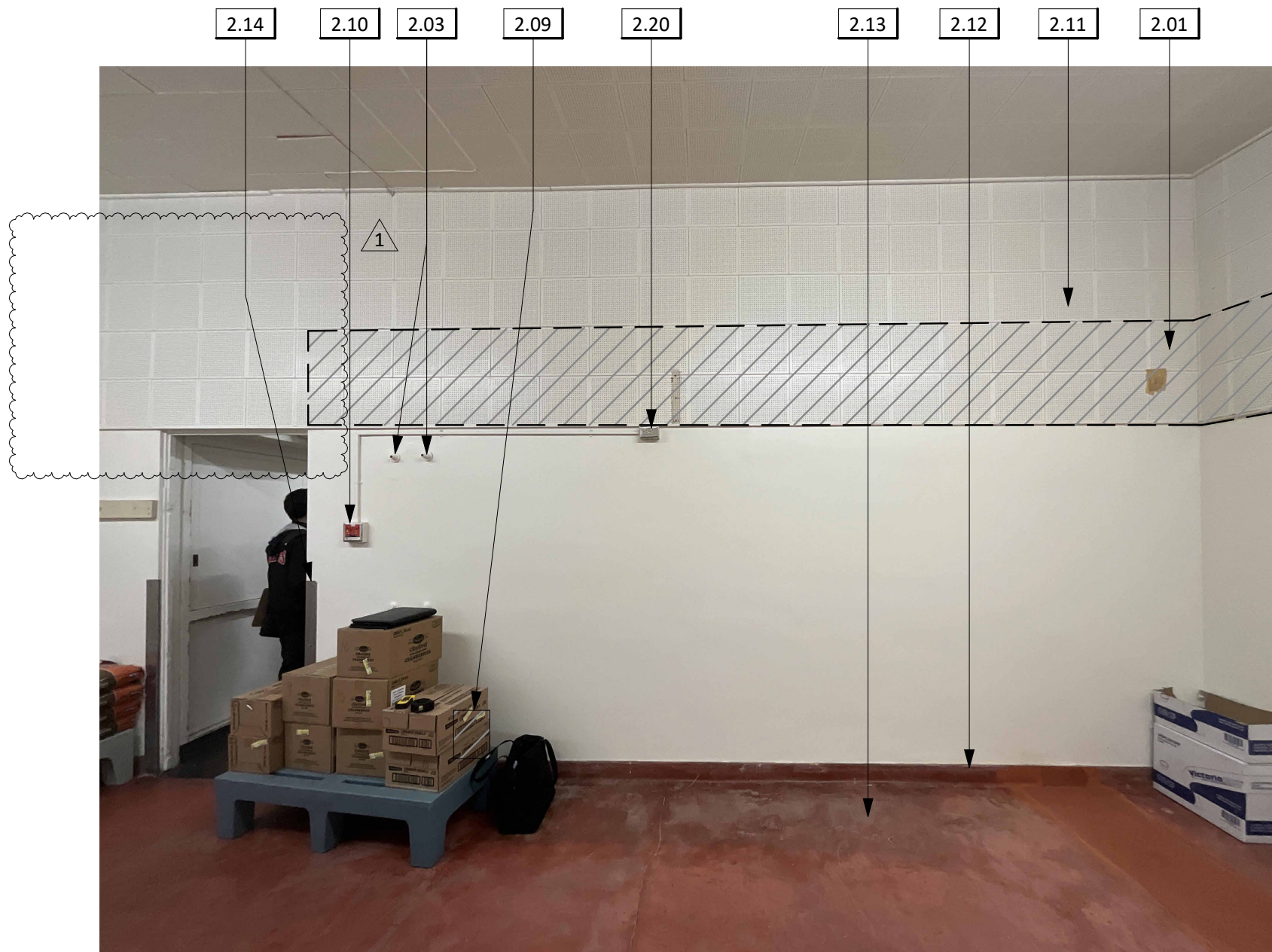
2 INTERIOR DEMOLITION ELEVATION - EAST 1/2" = 1'-0"