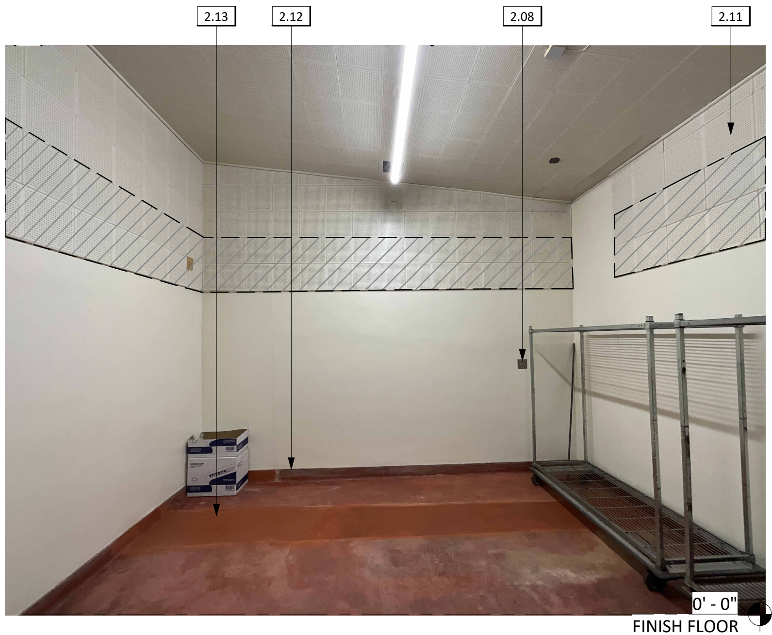
3 INTERIOR DEMOLITION ELEVATION - SOUTH 1/2" = 1'-0"